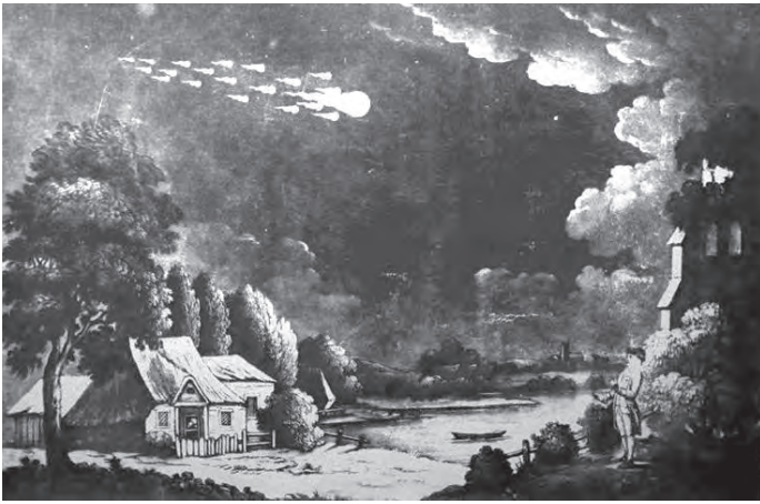
'An accurate representation of the meteor seen at Winthorpe on 18 th August 1783'. By Henry Robinson

The meteor of 18 th August 1783 was particularly notable: a dramatic ball of fire which passed the length of the British Isles from Shetland to Dover and on over continental Europe with sightings in the Netherlands, Belgium, France and Germany to perhaps as far away as Rome (Blagden 1784; Beech 1989). A letter from Whitby to the London Chronicle (26/8/1783) speaks of 'an extraordinary meteor ... whose lustre almost equalled the sun'. In a speech before the Royal Society Cavallo (1784) notes that 'every object appeared very distinct; the whole face of the country ... being instantly illuminated'. The meteor of 4 th October was almost as spectacular, described by Aubert (1784) thus: 'I saw, towards the N.N.E. a train of fire, resembling in its motion a common meteor, vulgarly called a falling star, but the colour of it was red ... almost as large as the moon; it illuminated the street and houses much more than any lightening I have seen'. Both of these meteors were seen from northern continental Europe, the 18 th August meteor passing not far from Paris. It is extremely probable that Franklin either saw one of these meteors personally, or was at least aware of their observation through his correspondence or personal contacts. It is likely that in suggesting meteors as a possible cause of the dry fog Franklin was not simply speculating but was well aware that a large number of bright meteors had been recently observed.