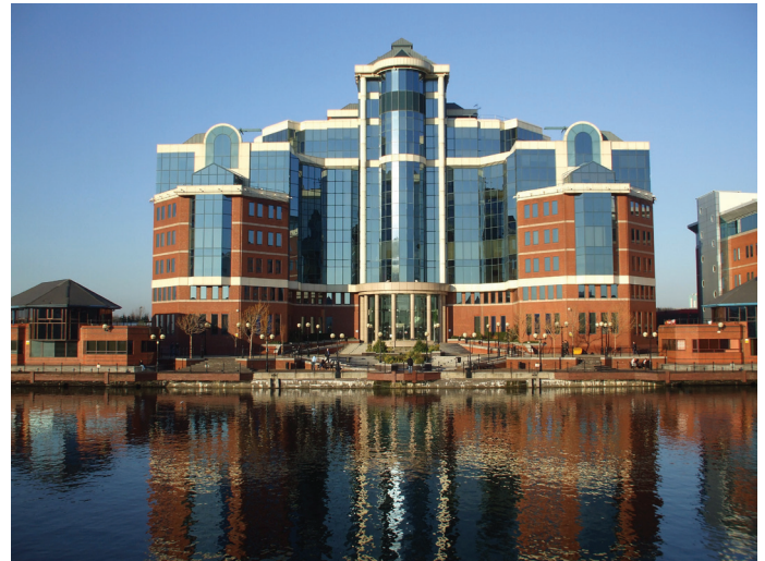
Victoria Building: site 5.

The central 116,000 sq. ft. Victoria Building was completed in 1992 in the midst of a recession. A second office building, The Alexandra with 61,000 sq. ft. of space was completed in 2002. The area between the Anchorage and these blocks has now been occupied by the Millennium Tower with over 200 apartments. Next is @mediacity occupied largely by Bupa. On the other side of the Victoria Building are the City Lofts.