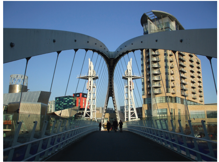
The Lowry footbridge: site 8.

which was constructed in 1994 to mark the 100th anniversary of the canal. Looking across the canal Manchester United's Old Trafford Stadium can be seen.