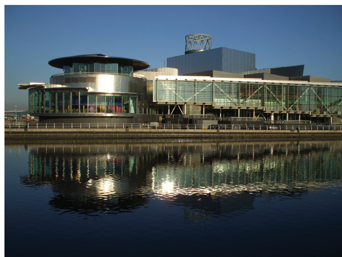
The Lowry: site 7.

8. The Lowry Bridge crosses the canal, and beyond the Quay West office building can be seen; next to it is and the striking Imperial War Museum of the North designed by Daniel Libeskind, and opened in 2002. Behind it is the Hovis flour mill built in 1907, the only survivor of Trafford Park's three mills. Today it uses imported wheat brought by road from Liverpool. Beyond, the new ITV centre is being built. Turn left and follow the Centenary Walk through a small park