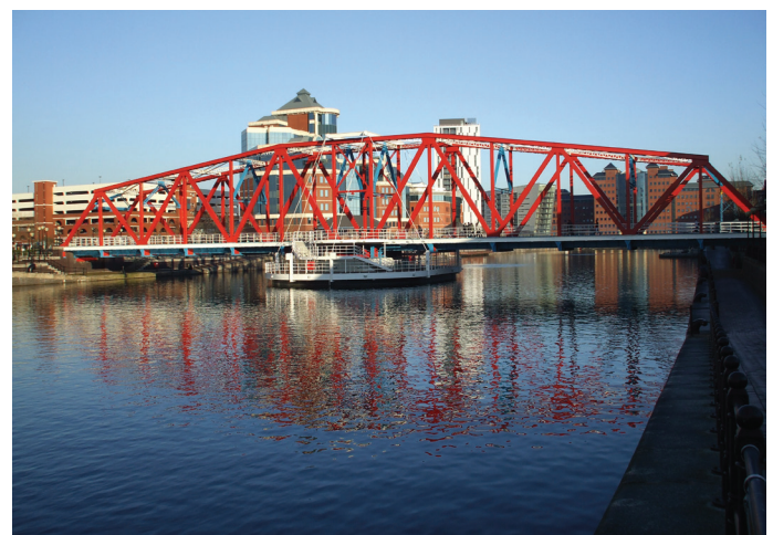
Detroit Bridge: site 6.

6. Turn left to cross Dock 9 over Detroit Bridge, a former railway bridge that was relocated here. This dock is used for events such as regattas. Turn right along the side of the Huron Basin towards the Lowry Outlet Centre and The Lowry. Look across the basin to where Media City is. Over £400 million was invested in this site by the developers Peel Holdings, and the North West Development Agency is contributing £40 million. In 2011 the BBC moved 2400 jobs here, from Manchester and London. This 200 acre complex will attract other media firms to the site and create over 15,000 jobs in all. There is also a new Metrolink station.