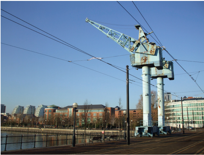
Ontario Basin at the start of the Trail.

1. The Ontario Basin is one of the former docks which is now cut off from the canal and entered by a lock at the western end. It is connected by canals to the other basins.